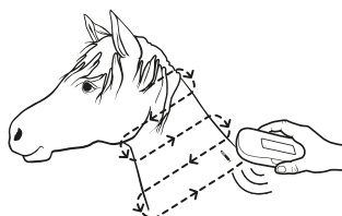
Pattern 2 - The reader is passed along the neck perpendicular to the mane