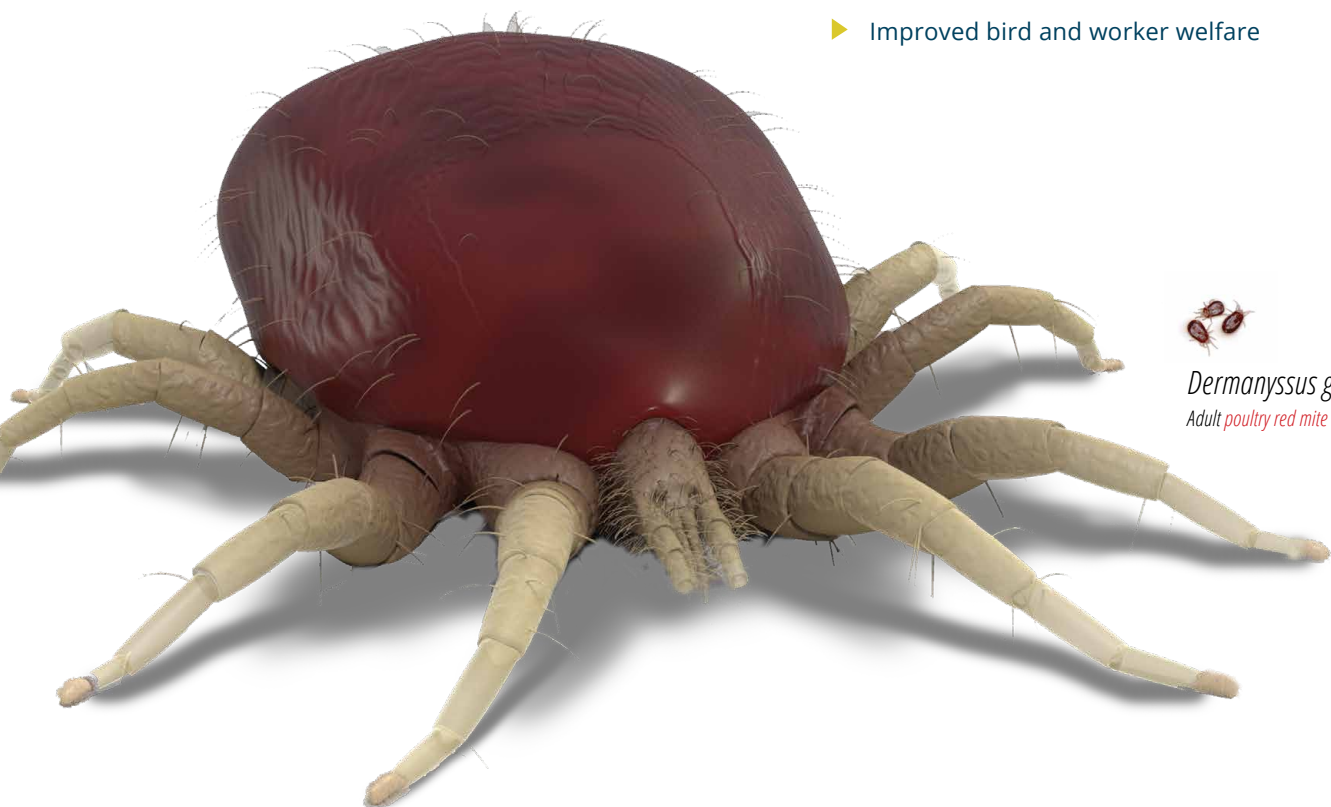
Dermanyssus gallinae Adult poultry red mite